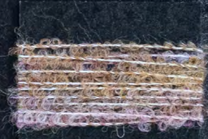
crema / lavanda