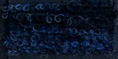
bleu / navy