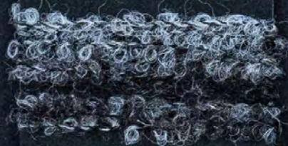
greggio / maron