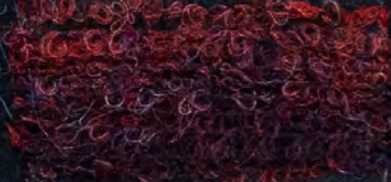
ciliegia / vinaccia