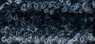
greggio / nero