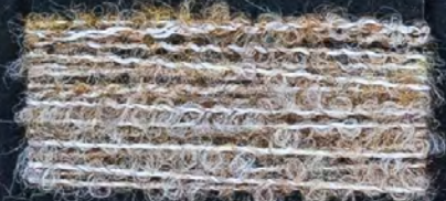
crema / beige