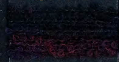
vinaccia / nero