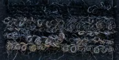
tundra / nero