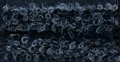
grey / nero