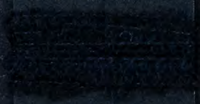
navy / nero