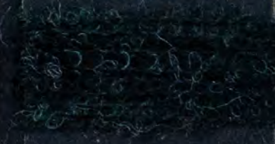
bosco / nero