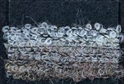
greggio / tundra