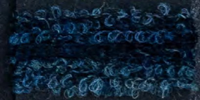
ottanio / navy