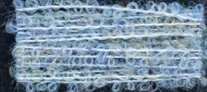
lichene / cielo