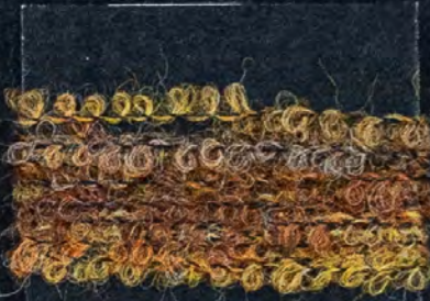
girasole / ruggine