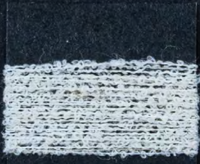
301 / bianco